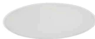
PLAFO 430 RE LED trimless version - mounted in the ceiling