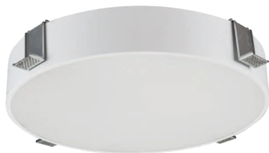
PLAFO 430 RE LED trimless version. Index no. 6574