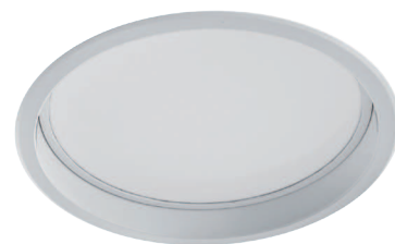
DL 320 LED - mounted in the ceiling